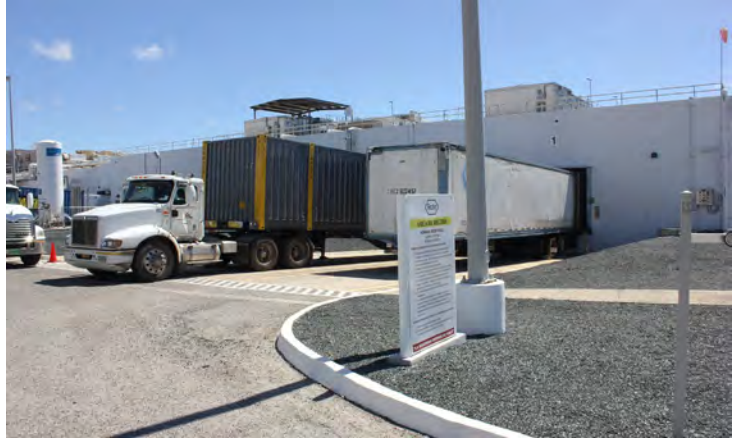
Material Receiving Area