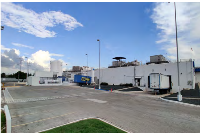
North Plant View